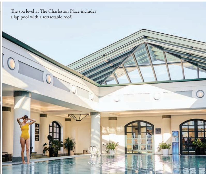
The spa level at The Charleston Place includes a lap pool with a retractable roof.

At the Palmetto Cafe, open for breakfast, brunch, and lunch, the blue/green walls with petite table lights in the same hue, louvered shutters on the angled ceiling, and a plethora of tropical plants and greenery lend the feeling of dining in an Orangerie. Here, patrons can indulge in Lowcountry classics interspersed with French-inspired dishes.