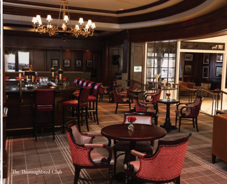
The Thoroughbred Club