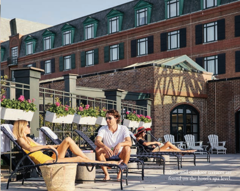
Indoor and outdoor terraces are found on the hotel's spa level.