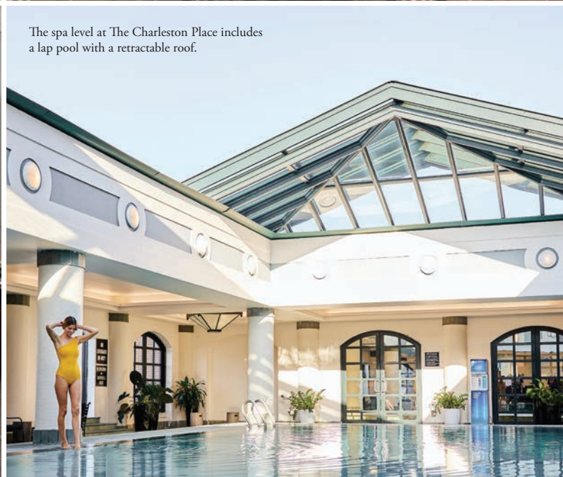
The spa level at The Charleston Place includes a lap pool with a retractable roof.

At the Palmetto Cafe, open for breakfast, brunch, and lunch, the blue/green walls with petite table lights in the same hue, louvered shutters on the angled ceiling, and a plethora of tropical plants and greenery lend the feeling of dining in an Orangerie. Here, patrons can indulge in Lowcountry classics interspersed with French-inspired dishes.