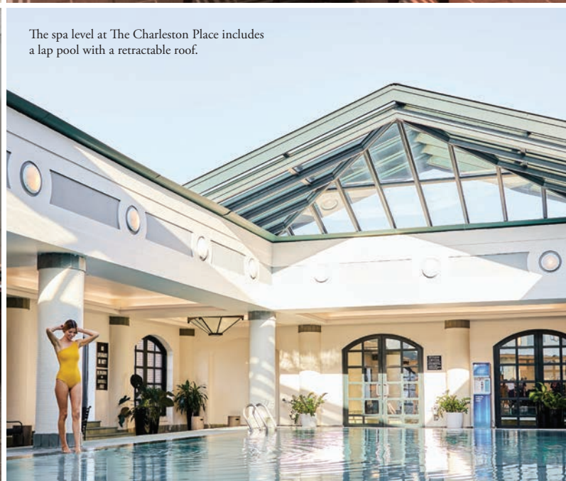
The spa level at The Charleston Place includes a lap pool with a retractable roof.

At the Palmetto Cafe, open for breakfast, brunch, and lunch, the blue/green walls with petite table lights in the same hue, louvered shutters on the angled ceiling, and a plethora of tropical plants and greenery lend the feeling of dining in an Orangerie. Here, patrons can indulge in Lowcountry classics interspersed with French-inspired dishes.