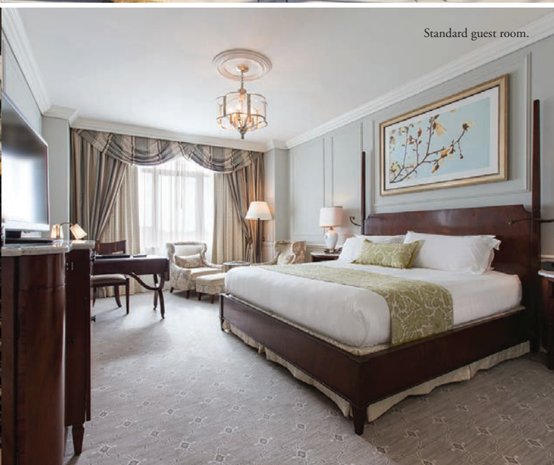
Standard guest room.